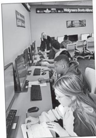
New Bedford High School's Academy of Finance, affiliated with the National Academy Foundation, has been officially designated as a distinguished national high school program.